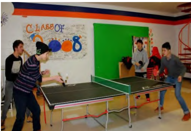
Lunch Time Leisure Activities