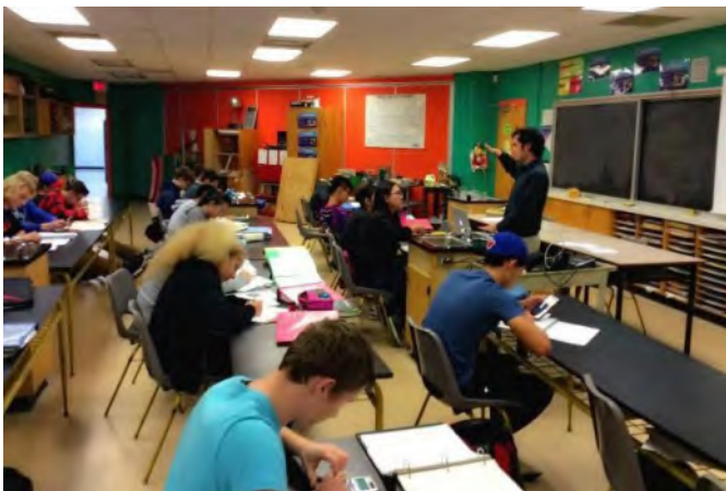
Small Class Teaching