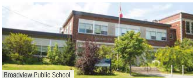
Broadview Public School