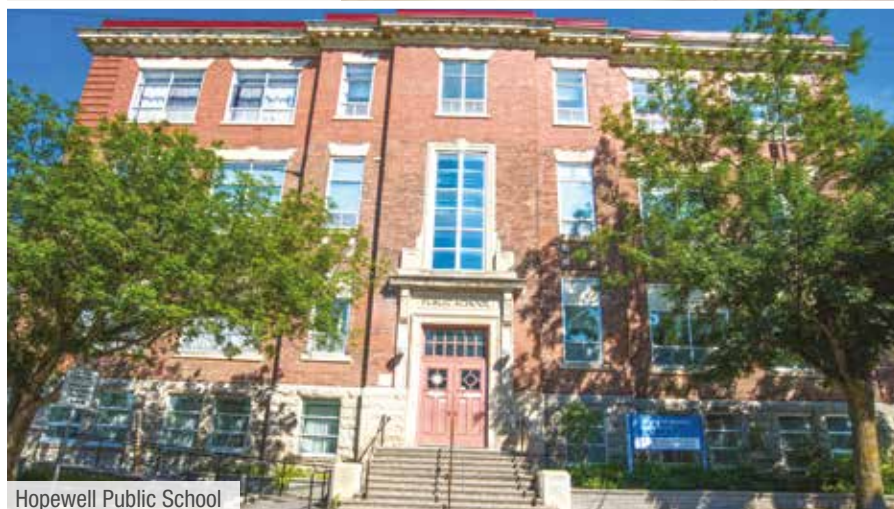
Hopewell Public School