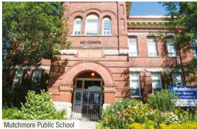
Mutchmore Public School