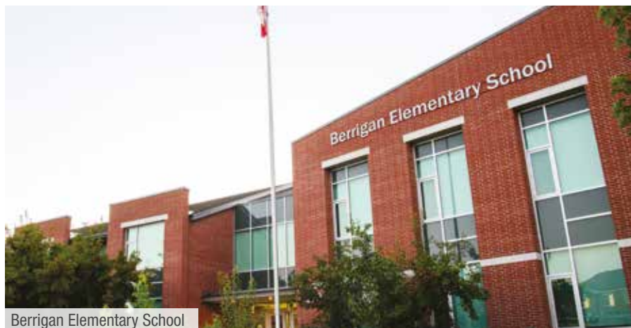
Berrigan Elementary School