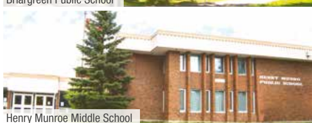
Henry Munroe Middle School