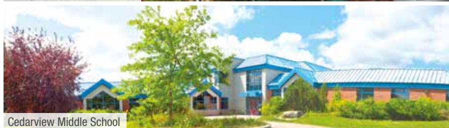
Cedarview Middle School