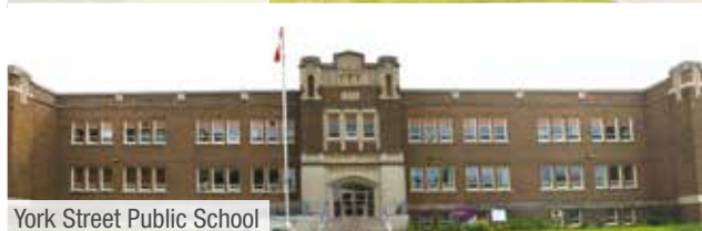
York Street Public School