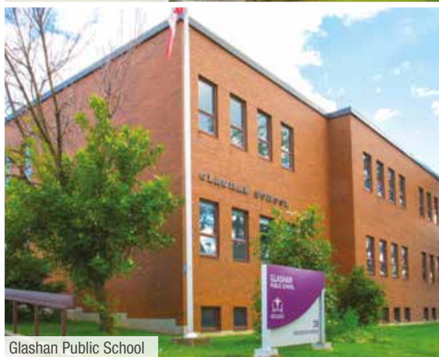
Glashan Public School