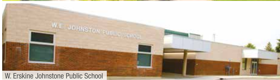
W. Erskine Johnstone Public School