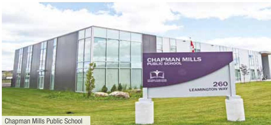
Chapman Mills Public School