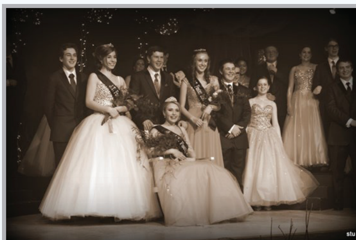
J.T. Foster School Queen's Ball participants, November 2014.