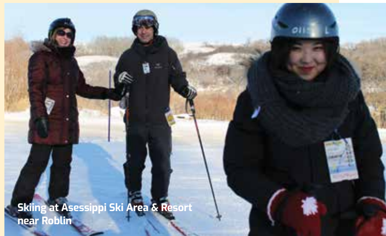
Skiing at Assessippi Ski Area & Resort near Roblin