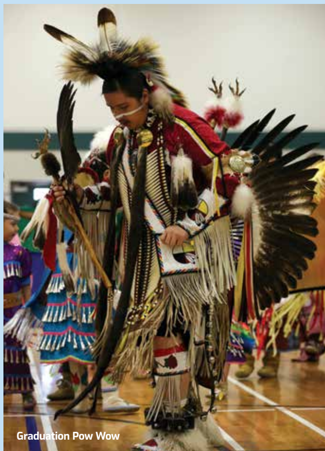
Graduation Pow Wow