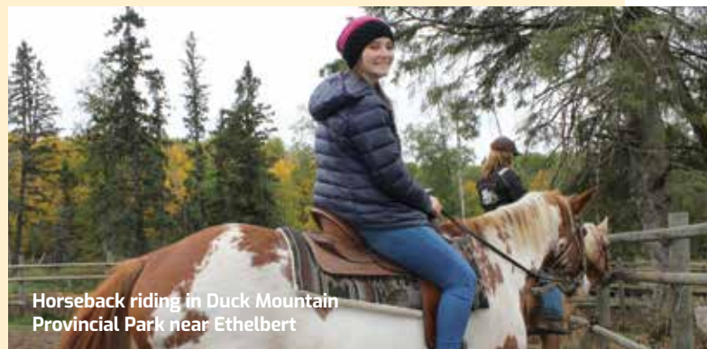
Horseback riding in Duck Mountain Provincial Park near Ethelbert