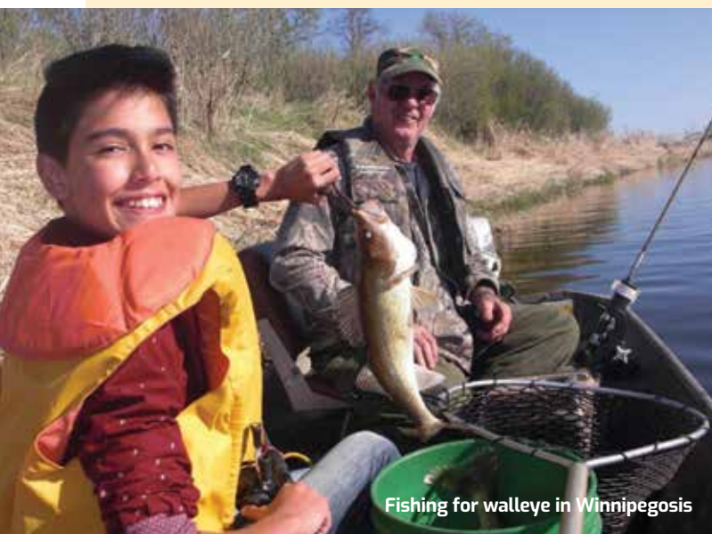
Fishing for walleye in Winnipegosis

The Village of Winnipegosis is a small rural farming community located north of Dauphin along Lake Winnipegosis. Two division schools are located in the village. For more information on what the municipality has to offer, please visit its website at mosseyrivermunicipality.com .