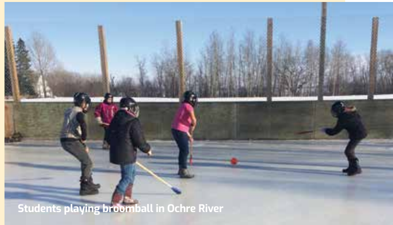
Students playing broomball in Ochre River