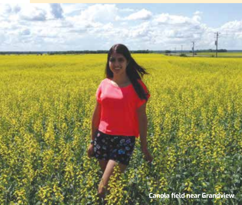
Canola field near Grandview

The Town of Grandview is located in the picturesque valley between Riding Mountain National Park and Duck Mountain Provincial Park. Mountain View School Division has one school situated in the Town of Grandview. Please visit the Town of Grandview website at www.grandviewmanitoba.com for more information on what the community has to offer.