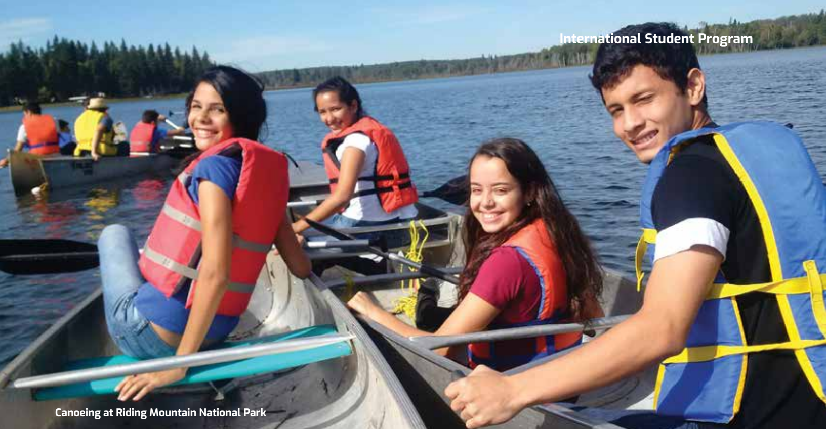
Canoeing at Riding Mountain National Park