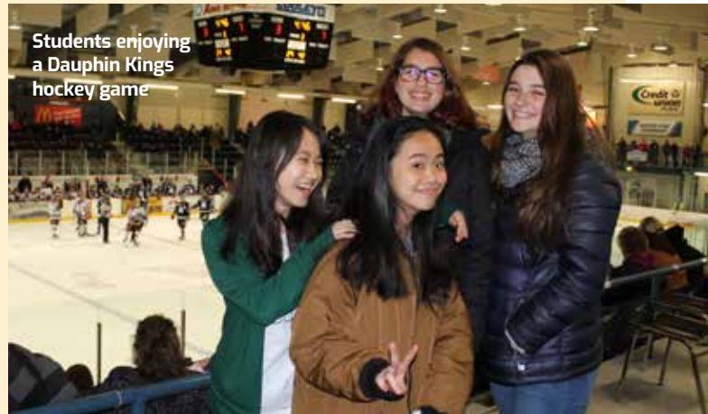
Students enjoying a Dauphin Kings hockey game

There are also five Kindergarten – Grade 5 schools in Dauphin. For more information on these schools, visit our website at www.mvsvd.ca/schools.cfm .