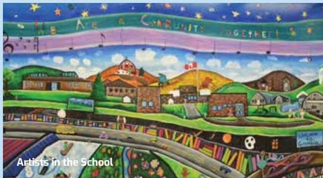
Artists in the School