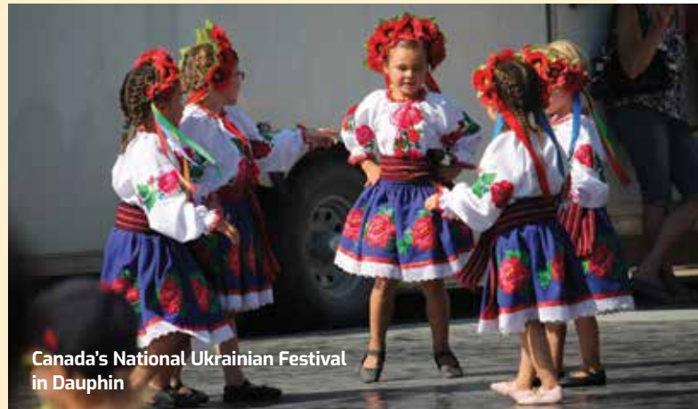
Canada's National Ukrainian Festival in Dauphin