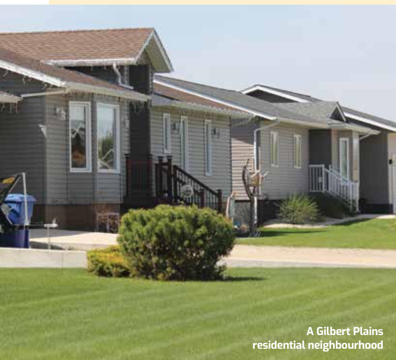
A Gilbert Plains residential neighbourhood

The community of Gilbert Plains is located in the valley between Riding Mountain National Park and Duck Mountain Provincial Park. Gilbert Plains is home to two division schools, a Kindergarten - Grade 8 school and a Grade 9-12 school. For more information on what Gilbert Plains has to offer, please visit its website at www.gilbertplains.com .